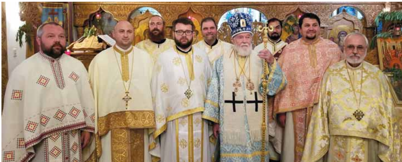
Hramul și Aniversarea Parohiei Sfânta Treime din Los Angeles, CA, 15 - 16 iunie 2019.