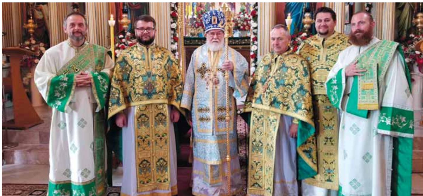
Slujire Arhierească de Praznicul Sfintei Treimi la Parohia Sf. Maria din Anaheim, CA, 17 iunie 2019.