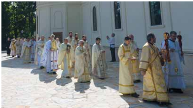
Sfințirea bisericii Parohiei Sf. Trei Ierarhi din Mountlake Terrace, Seattle, WA, 17 - 18 mai 2019.