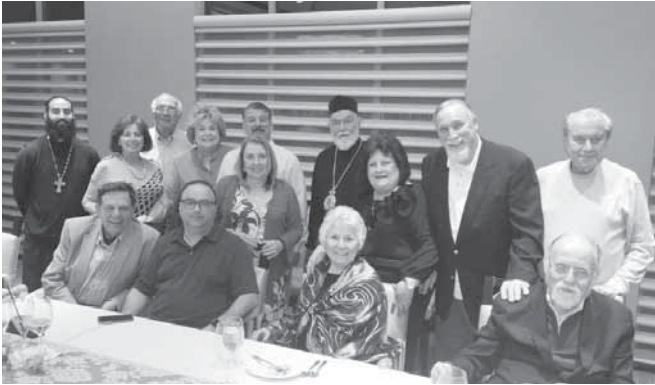
Fellowship and Dinner gathering on Thursday evening before the OCL Spring Board Meeting. The Meeting was held at St. Peter the Apostle Mission, Bonita Springs, Florida, on Friday, March 29, 2019.