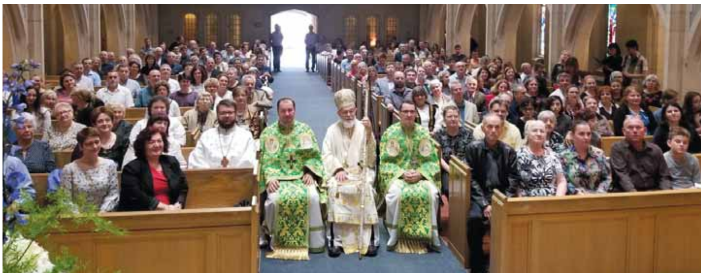
Aniversarea de 20 de ani a Parohiei Sf. Ioan Evanghelistul, Toronto, Ontario, Canada, 26 mai 2019.