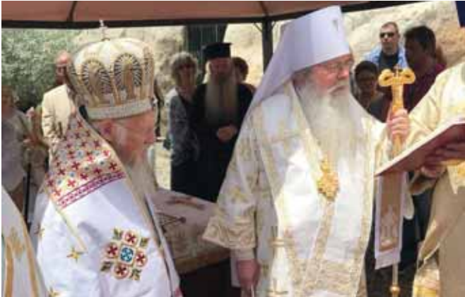
Ecumenical Patriarch Bartholomew concelebrating with Metropolitan Tikhon

DEREYAMANLI, CAPPADOCIA, TURKEY [OCA] -- Orthodox Christian faithful who trace their roots to Cappadocia filled the Church of the Mother of God here on the Sunday of All Saints—June 23, 2019—as His All-Holiness, Ecumenical Patriarch Bartholomew of Constantinople and His Beatitude, Metropolitan Tikhon concelebrated the Divine Liturgy.