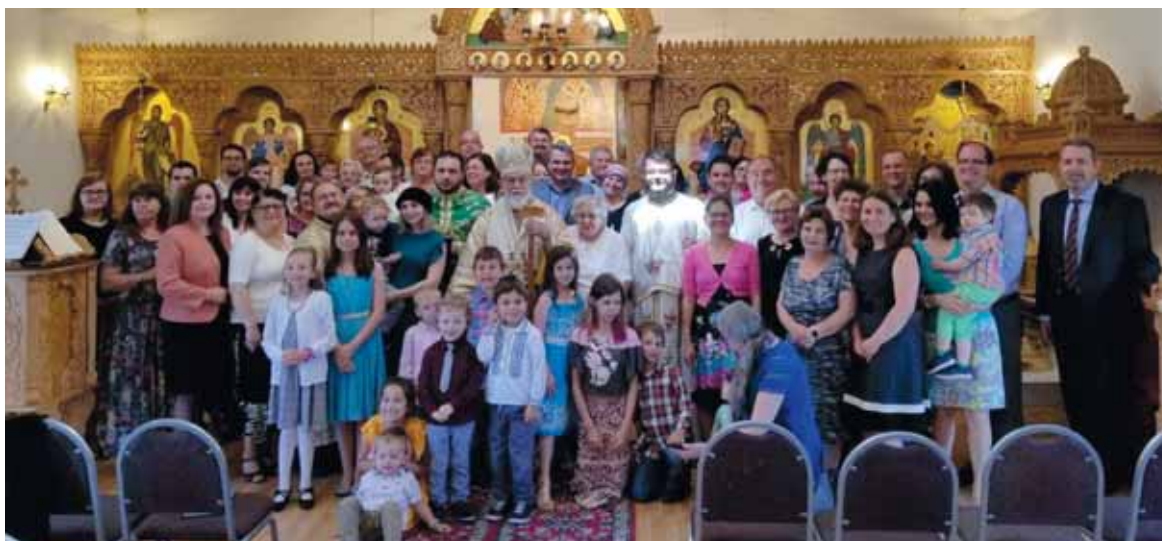
Vizita Părintelui Arhiepiscop în Parohia Bunavestire din Grand Rapids, MI și instalarea noului preot paroh, 23 iunie 2019.