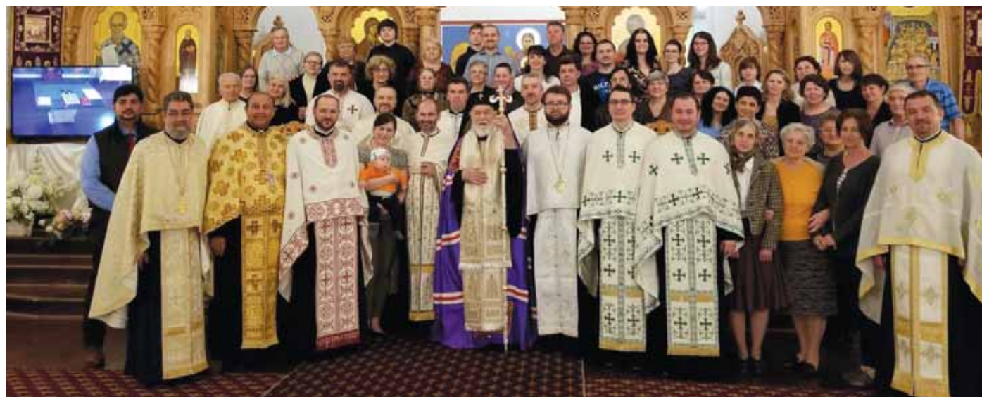
Clerul slujitor la vecernia dinaintea sfințirii bisericii Parohiei Sfinții 40 de Mucenci, Aurora, Ontario, Canada, 24 - 25 mai 2019.