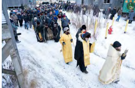
Procession with the relics of Matushka Olga